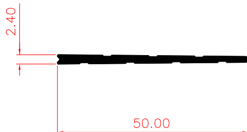
ACL-0013 | 0,251 kg/m